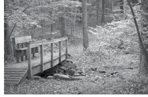
The Blue Trail at the Alice Newton Street Memorial Park

Sometimes we don't realize what's in our own backyard! The Woodbridge Park Association offers great opportunities for exploring nature, seemingly far from the hustle and bustle of our everyday lives. In reality, the largest park area can be accessed easily from the center of town, on Meetinghouse Lane, where there is ample parking. There, on any of the trails, visitors are immediately enclosed by a canopy of varied tree species while exploring all that nature